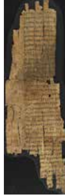
The second of three fragments of the original Greek text of the Gospel of Thomas. Excavated in Middle Egypt, 1903.

'Papyri and parchments of inestimable importance will turn up' predicted Mme. Blavatsky in Isis Unveiled . And just like that, a treasure trove of Gnostic texts was discovered in Egypt