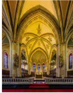
Apse, Assumption Church, Windsor

Each of the world's major Religions has its essence or source in the life-giving Divine Wisdom or Theosophy. We may find somewhere within them the three truths found in Light on the Path , if I may paraphrase: the One Life or Principle inseparable from all things which gives life and which may be known; that there are sparks within the flame moving through many lives whose growth and splendour has no limit; and that there is a Law of Eternal Justice under which all these things work. Also, freedom of thought was encouraged by St. Paul when he said, like the Buddha, to 'prove all things, and hold fast to that which is good' (1 Thessalonians 5:21).